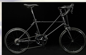
Moonlit Night Black

Powder coated Custom color painting available