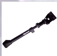
Kick stand for FCX