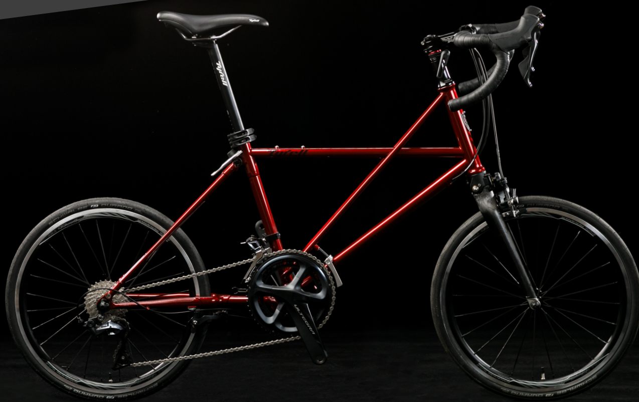
This photo is the image of complete bike