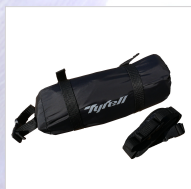
Carrying bag Travel light