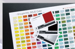
Custom color painting available