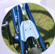
Booster Plate for FCX